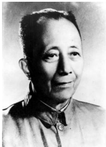
Ryc. 5. Li Jinhui (1891-1967) 30

When discussing the development of Chinese opera, we cannot overlook the figure of Li