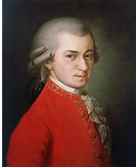
Ryc. 1. Wolfgang Amadeus Mozart (1756-1791) 7