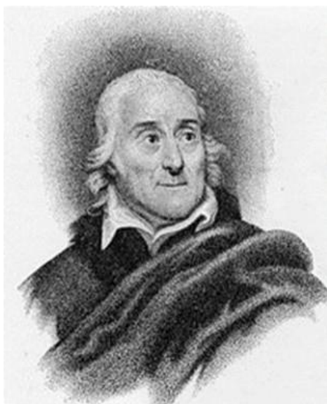
Ryc. 4. Lorenzo Da Ponte (1791-1838) 19

Early lessons in counterpoint from his father Martini quickly led Mozart to master polyphonic composition. Intensely interested in the polyphonic culture of German and Austrian music, Mozart adapted several fugues by Johann Sebastian Bach into string trios (K.404a), quartets (K.405), and the C minor fugue for two pianos (K.426). Bach's influence on Mozart was deep and lasting, as evidenced by the increasingly frequent use of counterpoint in Mozart's later works, such as Die Zauberflöte (The Magic Flute) and Requiem .