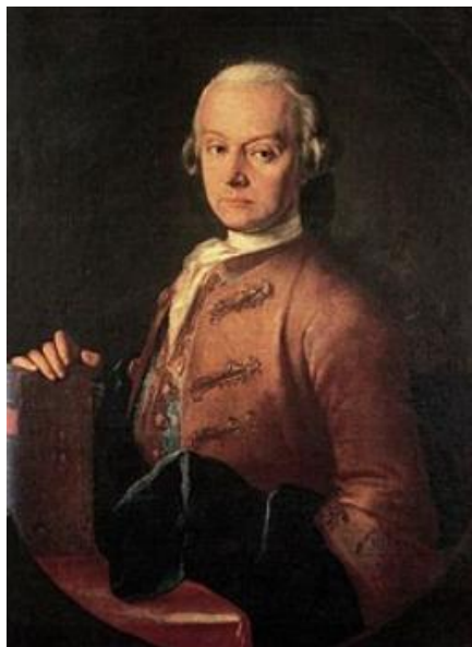
Ryc. 2. Johann Georg Leopold Mozart (1719-1787) 9

quickly absorbed all the beautiful sounds and techniques, imitating the works of others and even improving upon them. The creative ideas of some composers were also continued in the creation of his works. In this way, Mozart's compositions synthesized the musical treasures of all nations during the Classical period and became a mirror of the Classical music era.