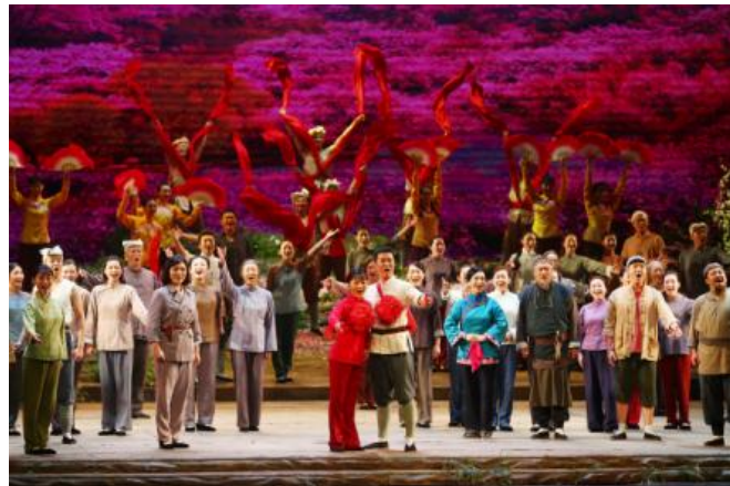
Ryc. 9. Opera The Marriage of Xiao Er Hei (小二黑结婚) 57

determined the direction of later Chinese operatic creations. At that time, opera was profoundly influenced by Ma Ke's concept of "developing opera based on traditional Chinese opera," which can be regarded as the most fundamental theoretical foundation for Chinese opera composition and performance. The great success of this opera during this period also signaled the impending arrival of the second peak in the history of Chinese opera.