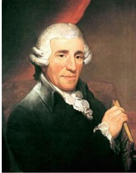
Ryc. 3. Franz Joseph Haydn (1732-1809) 14