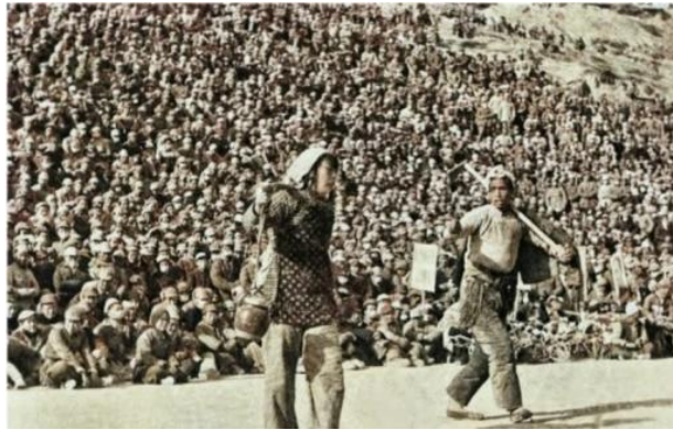
Ryc. 7. Opera Brothers and Sisters Reclaim the Wasteland (兄妹开荒) 51

歌剧), integrating singing, dancing, and dramatic elements. This development transformed Chinese opera into a folk (peasant), revolutionary, and contemporary art form. The themes of yangge opera were broad, encompassing almost all aspects of mass life at the time, with most works reflecting current events. Their melodies were largely adapted from local theatrical forms or folk songs. In terms of performance structure, yangge opera was relatively simple, typically featuring two or three roles, with the storyline conveyed in a narrative style and a relatively flexible performance format. Representative works of this genre include Brothers and Sisters Reclaim the Wasteland ( Xiongdì kāi huāng 兄妹开荒) (1943) by An Bo and Zhou Zishan (周子山) (1943) by Ma Ke, Shi Le Meng, Zhang Lu, and Liu Chi.